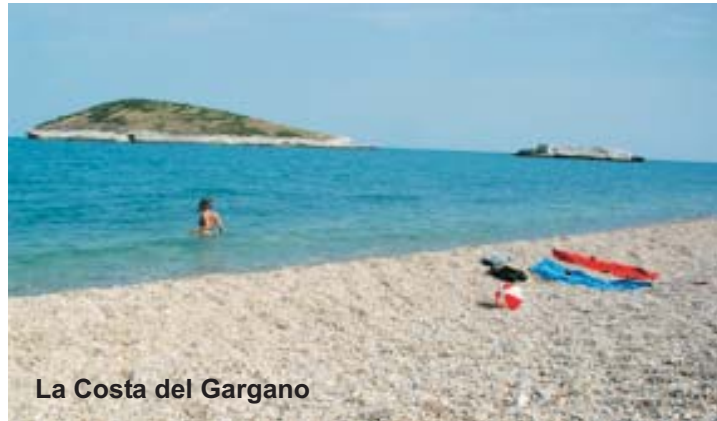
La Costa del Gargano