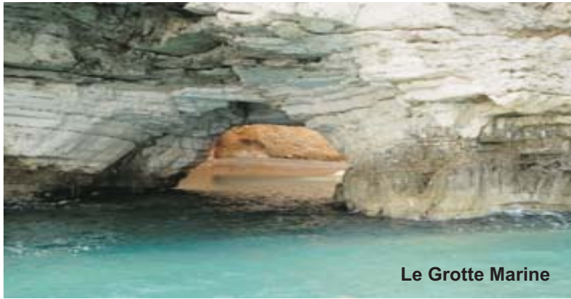
Le Grotte Marine