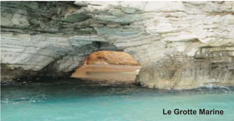
Le Grotte Marine