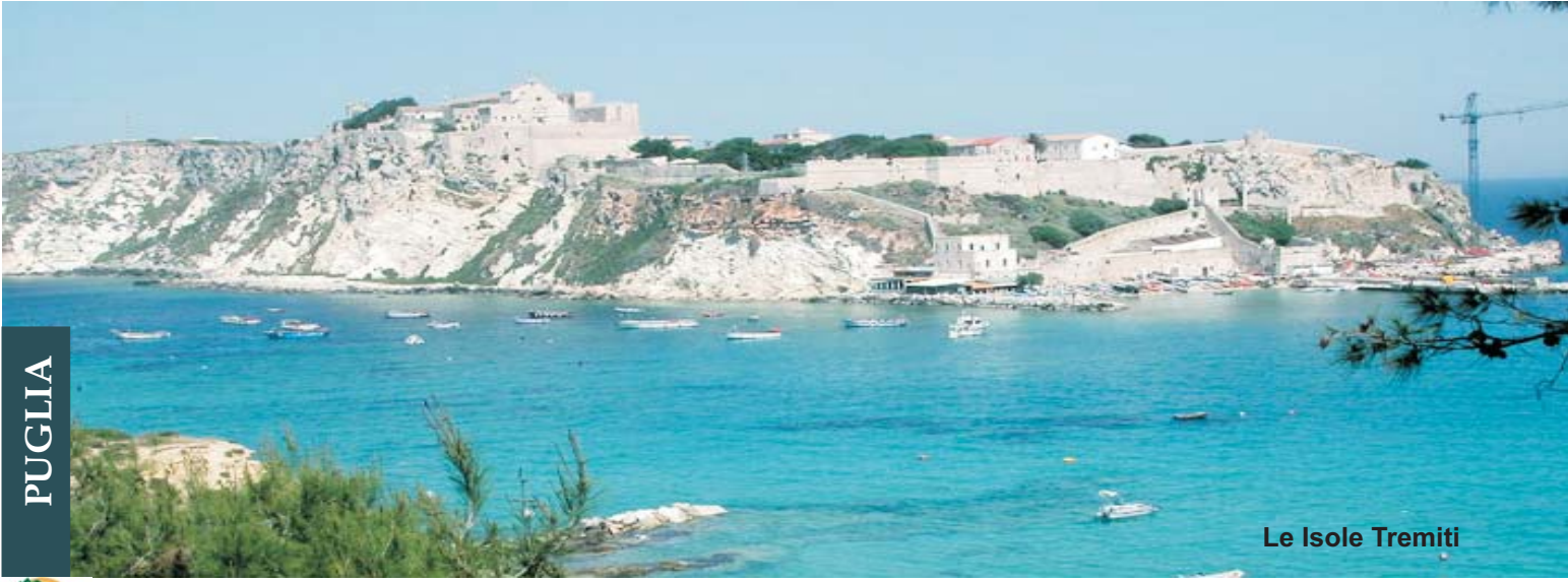
Le Isole Tremiti