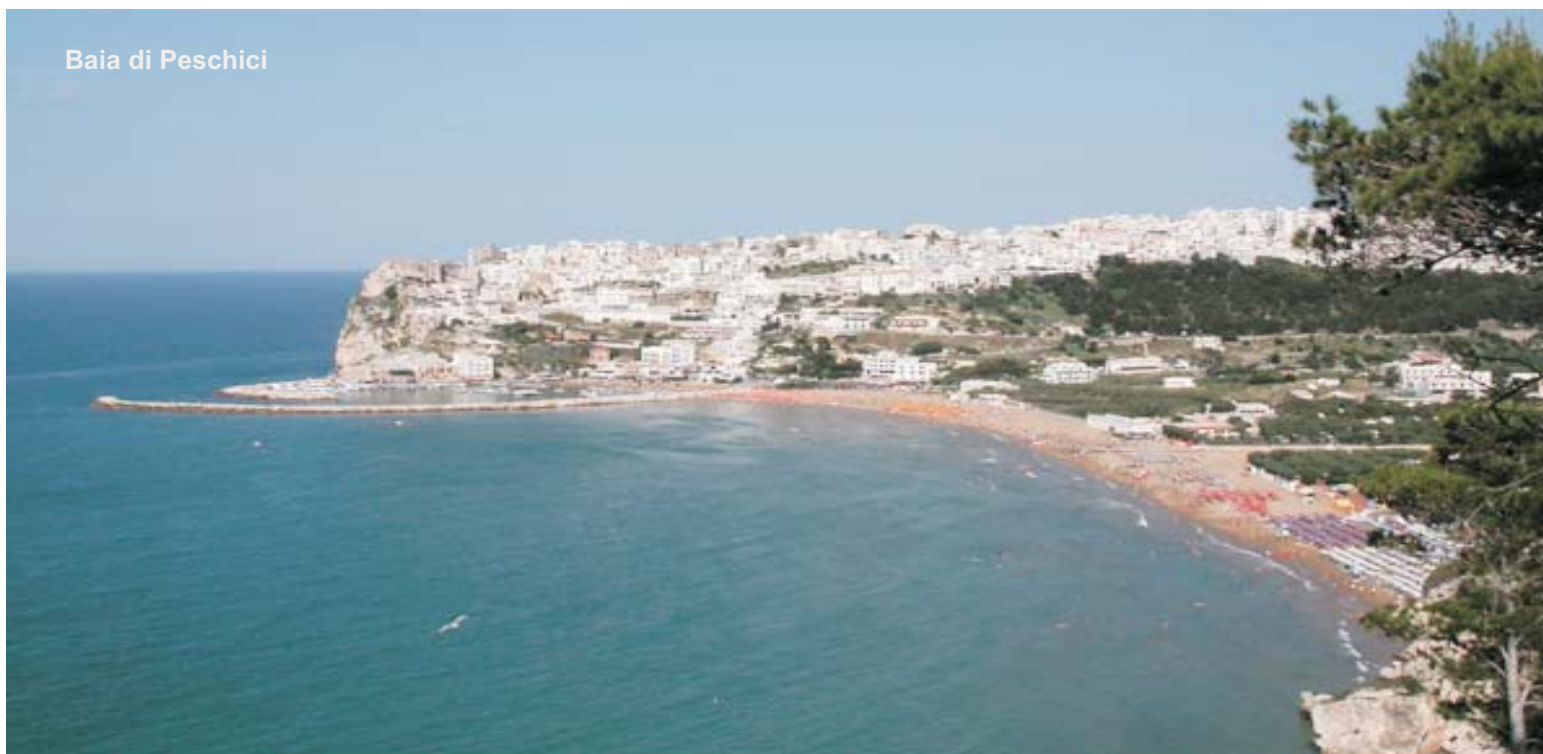
Baia di Peschici

The Residence is set in good position to few footsteps from the center city and from the shopping, the beach is not very distant, but however well connected with Bus shuttle, the Residence is proper for whom desires to have the whole disposition services in an informal environment.