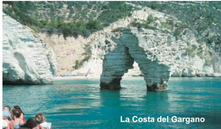
La Costa del Gargano