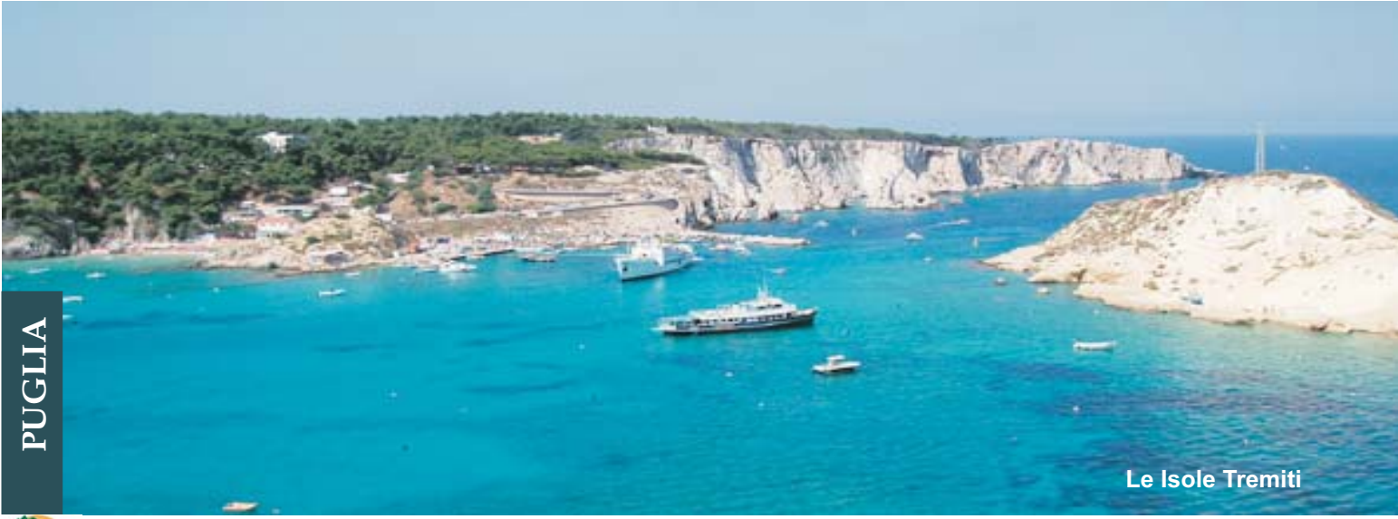
Le Isole Tremiti