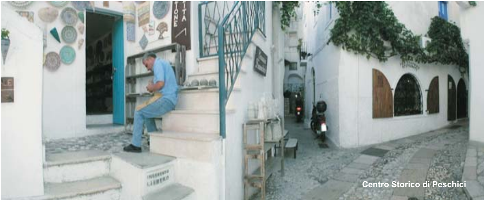
Centro Storico di Peschici