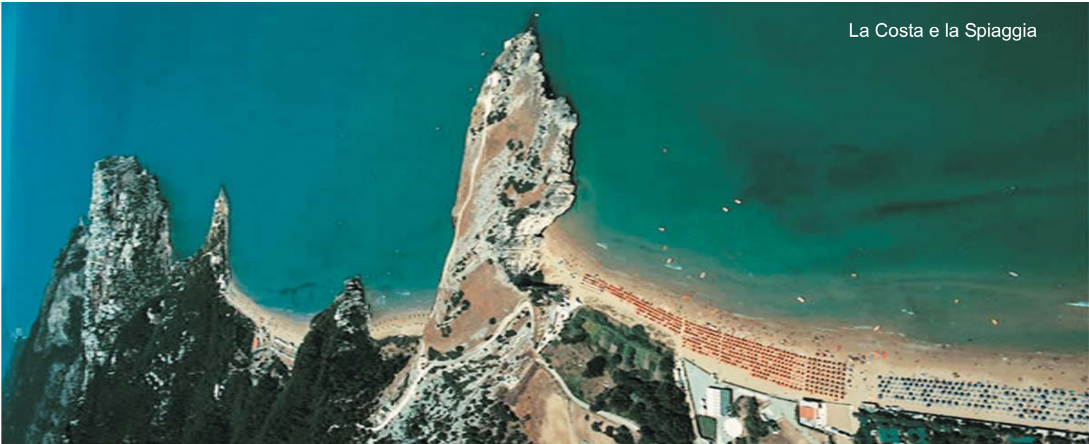
La Costa e la Spiaggia