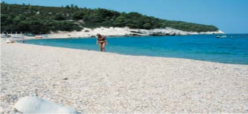
La Costa del Gargano