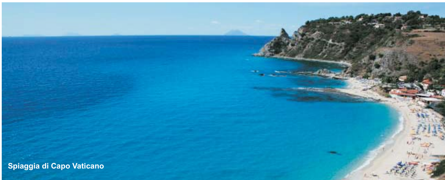
Spiaggia di Capo Vaticano