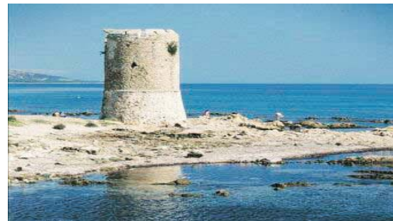
Spiaggia di San Giovanni