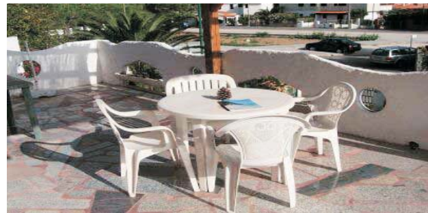
Spiaggia di San Giovanni