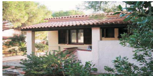
Spiaggia di San Giovanni