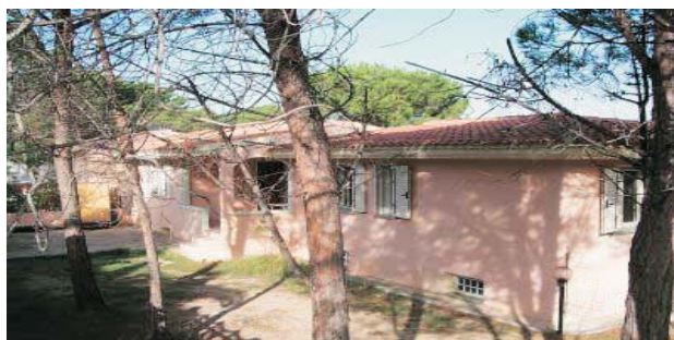
Spiaggia di San Giovanni