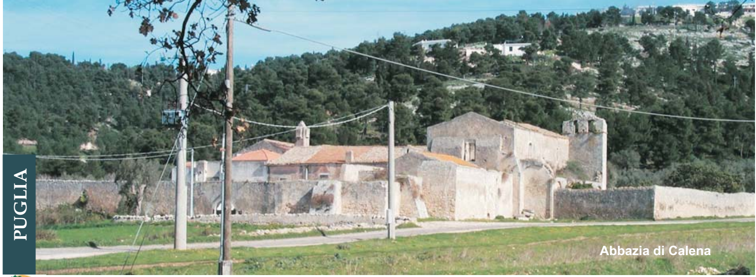
Abbazia di Calena