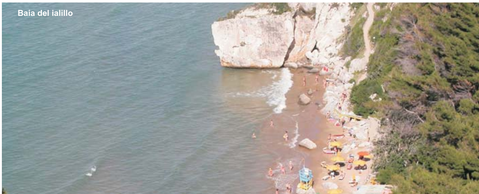
Baia del ialillo

Possible with Checks, Cash, Pos, Credit cards: Mastercard, Visa.